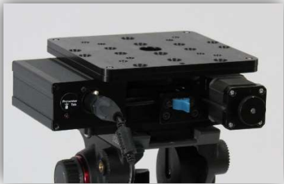
Shown with PTZ Camera Controller, TelePrompting hood, TalentMonitor and Tripod (not included)